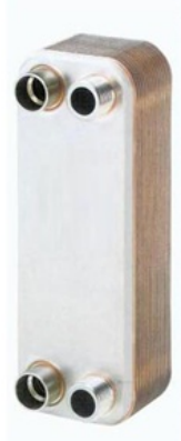
plate heat exchanger:

With dedicated professional members in engineering, production, management and marketing team, we are sincerely willing to cooperate with you from the beginning to the end. Our service covers from project consultation, product design, sampling, production to quality control, technical support, after sales service and other important functions.