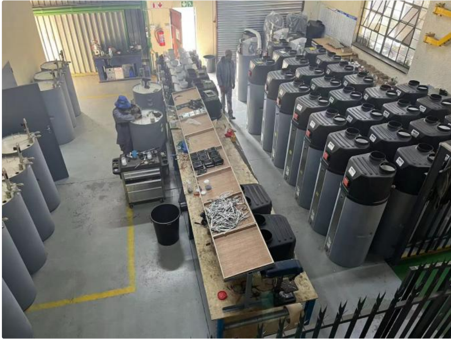
Final installation ready