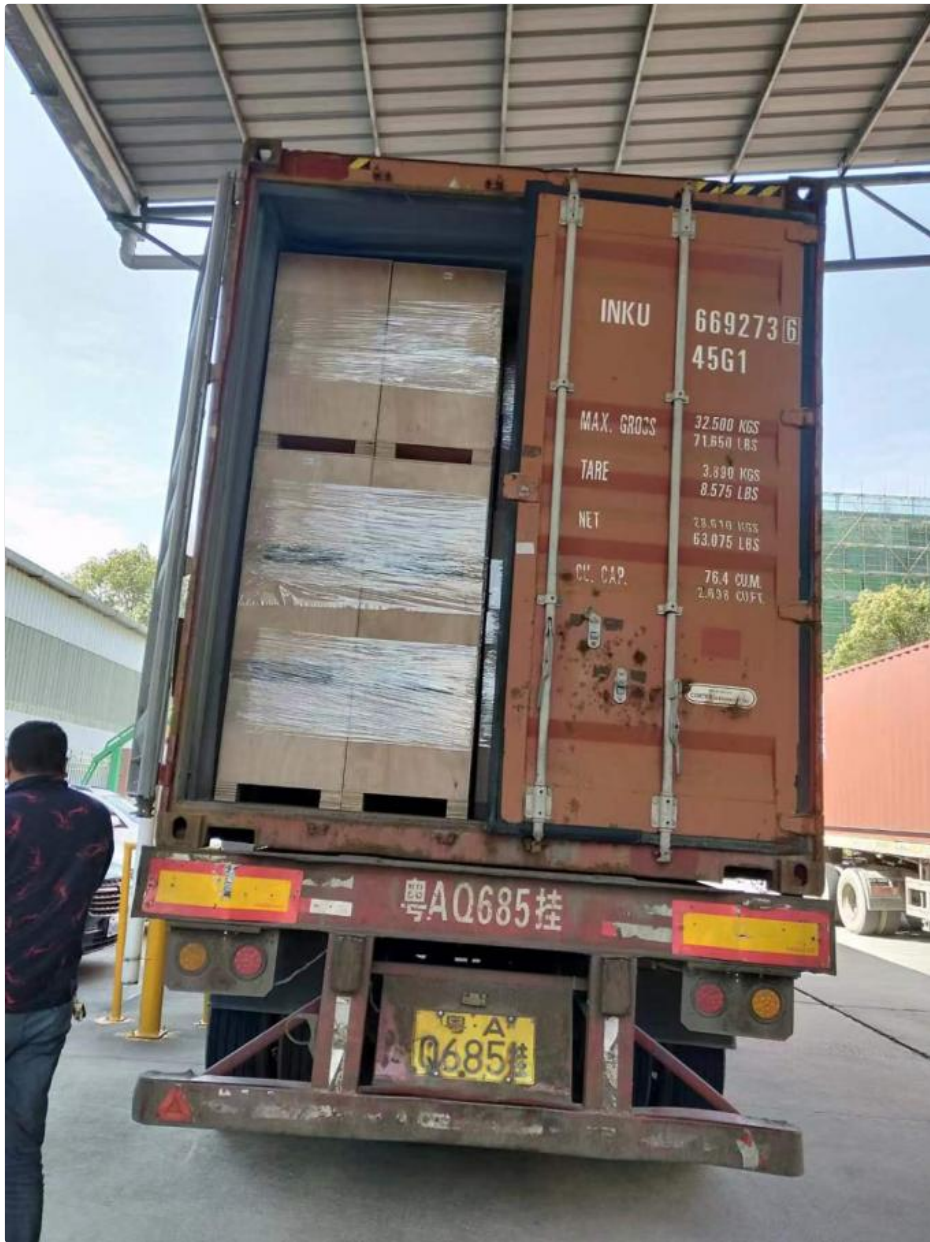
Customers add water tanks locally